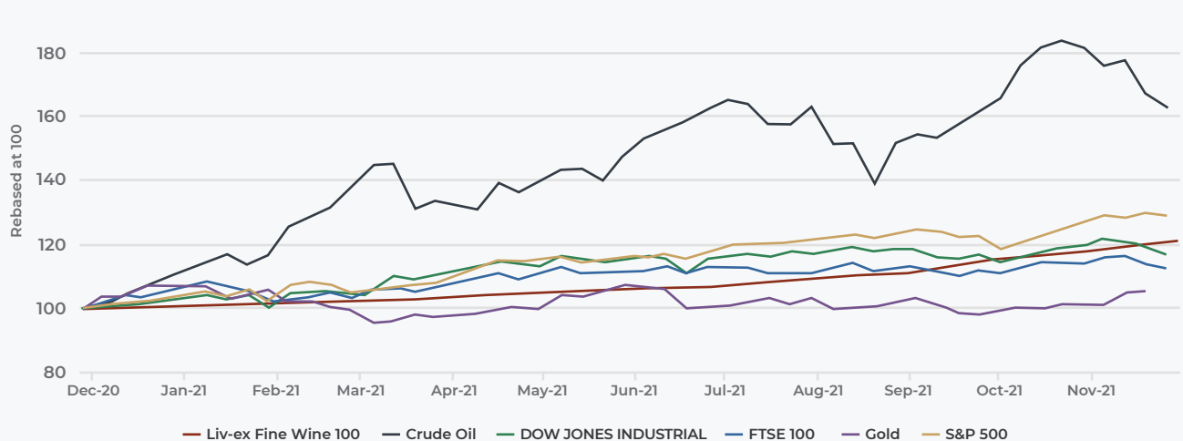
TABLE 2: LIV-EX FINE WINE 100 VS MAJOR EQUITIES AND COMMODITIES